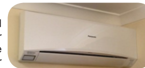
Right Hand Discharge

When the indoor head unit is mounted on an internal wall in the corner adjacent to an external wall with the pipework coming out the left or right hand side.