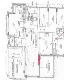
Up and Over